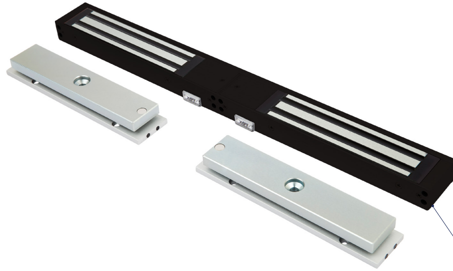
EM3500DM-BLK MONITORED DOUBLE ELECTRO MAGNETIC LOCK