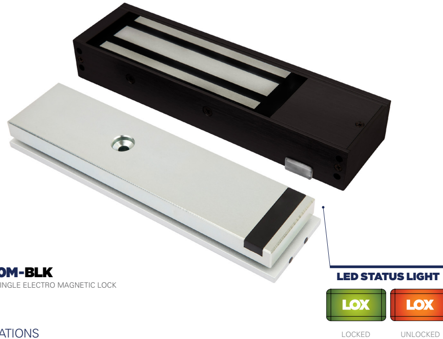
EM5700M-BLK MONITORED SINGLE ELECTRO MAGNETIC LOCK