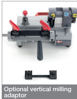
Optional vertical milling adaptor

Weighing less than 8kg, and with a convenient carrying handle, Flash Bit Plus is easily transportable.