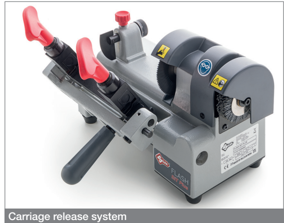
Carriage release system

The three-sided revolving clamps feature a special blocking system for Abus* and Abloy* type keys. Locksmiths can benefit from a selection of optionals to widen the range of keys cut including a vertical milling adaptor.